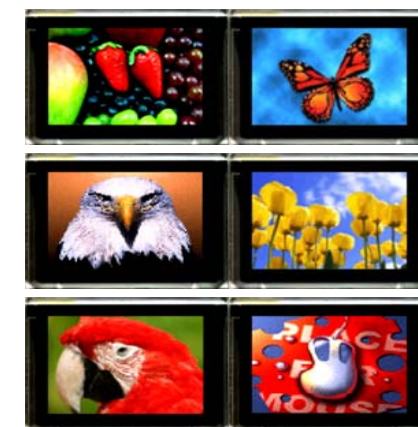
figure 2: Sample screen shots